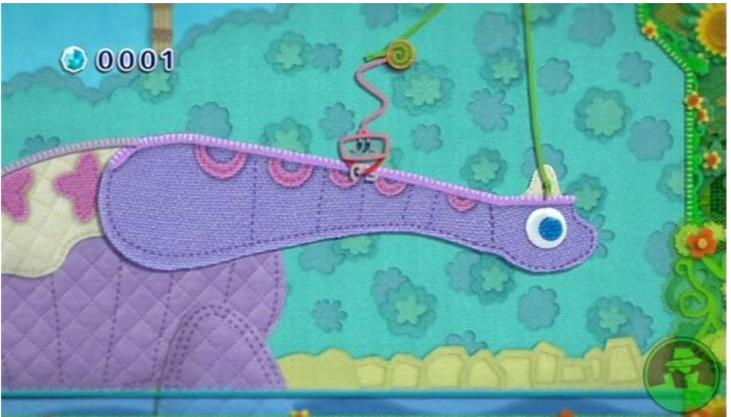
Images from Kirby's Epic Yarn. I really appreciate the texture of everything. Even though Wandersong itself isn't as textured, I like the use or mimicking physical media in this context.