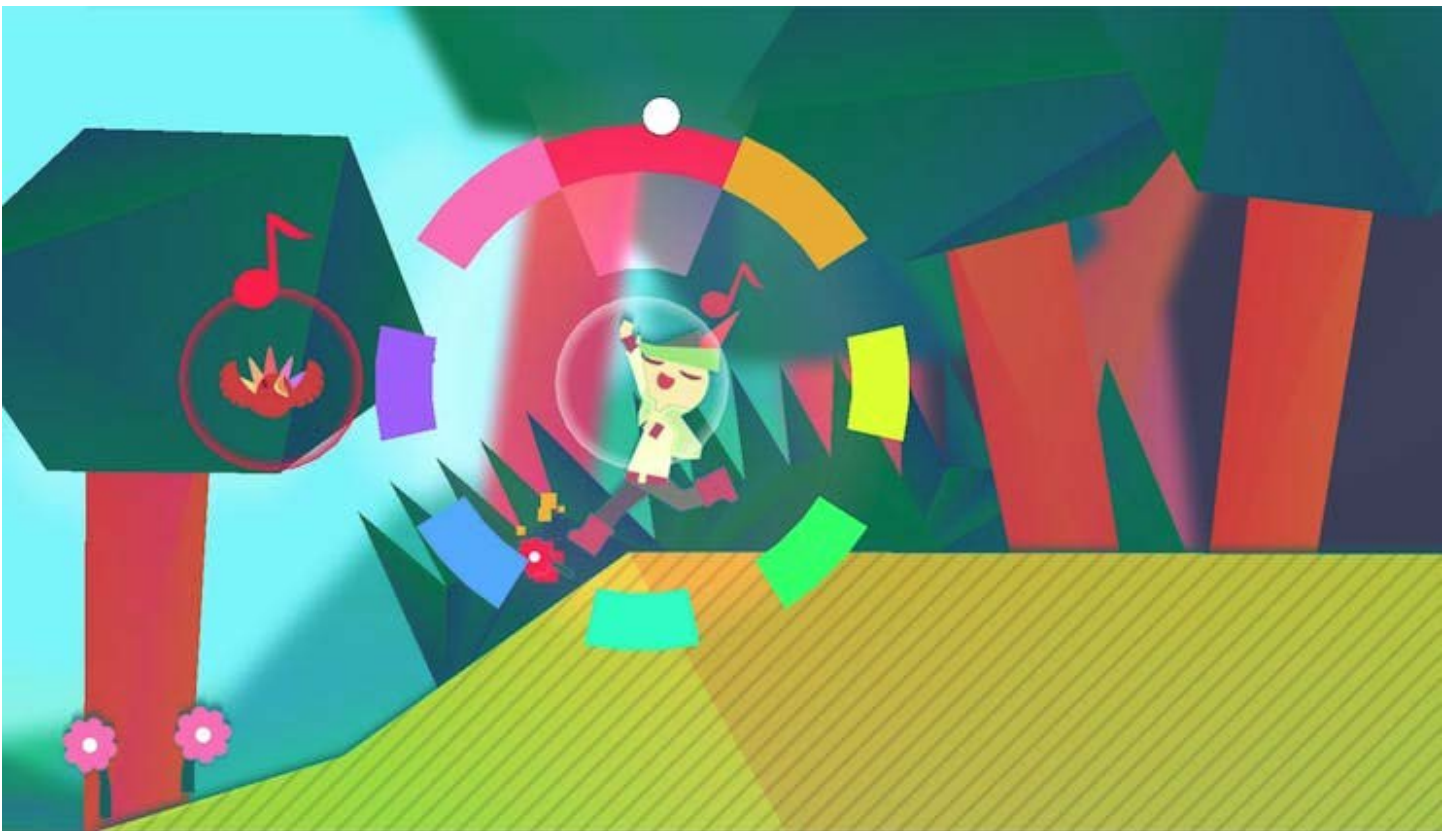
Some screenshots from the game. This second one includes the music/color wheel mechanic, which I would like to include somewhere on the site.